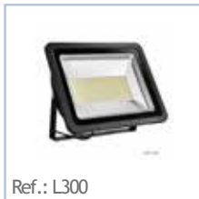
Ref.: L300 Projector LED LAMP 300W