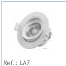
Ref.: LA7 FIXED DICHROIC RING LAMP 7W