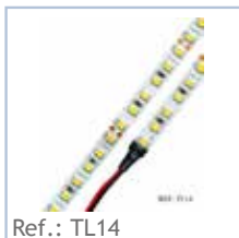
Ref.: TL14 STRIP LED 14W (L/M)