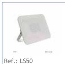
Ref.: LS50 Projector LED LAMP 50W