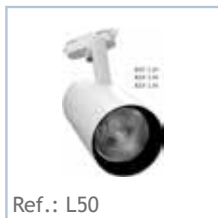
Ref.: L50 FIXED LED LAMP 50W