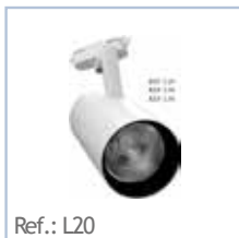
Ref.: L20 FIXED LED LAMP 20W