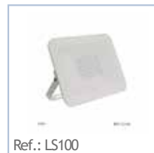
Ref.: LS100 Projector LED LAMP 100W