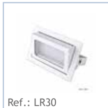
Ref.: LR30 FIXED RECTANGULAR LED LAMP 30W