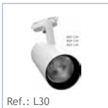
Ref.: L30 FIXED LED LAMP 30W