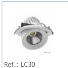
Ref.: LC30 FIXED RING LED LAMP 30W