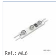
Ref.: ML6 MODULE BACKLIP LED 6W