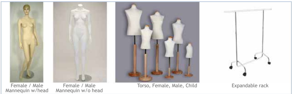
Female / Male Mannequin w/head